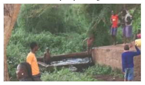
Boys swimming in the Namelok swamp, the current water supply for Namelok Community.

Our newest borehole will soon be drilled in Namelok. In Maasai, Namelok means sweet place: sweet, as in "Tasty, savory, attractive". Namelok is located 25 miles from Amboseli National Park in southern Kenya, and is a growing community. People seeking to try their hand at farming move to the area, dig shallow wells and pump water out for irrigation. Currently, drinking water comes from surface water from the swamp or shallow wells. Water quality is poor. The medical officer at the clinic reports many cases of diarrhea, amoebic dysentery and digestive tract issues caused by dirty drinking water.