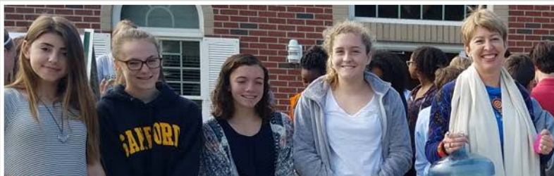
Sanford Water Walk