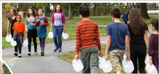
NCCL Water Walk

Asked how carrying water around the reservoir was, a UD student said "It was harder than I expected. Definitely!"