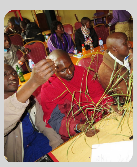
Risa livestock group members at the grassland management training