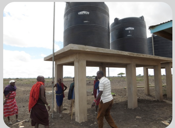
The water tanks at Enkong'u Narok

We need clean water, the swamp water is dirty, it's risky for the children because of the wild animals, malaria is a problem. Please, you know us. Help us. "