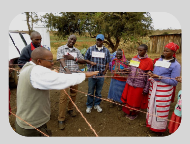
Web of life training

Working together, called "Harambee" in Swahili, is a central part of Kenyan life. However, outsiders often look to do the work of ending poverty themselves. At Water Is Life Kenya, we firmly believe in working together with communities in each of our projects. By working together, ground-level innovation has the opportunity to sprout like the way Olchorro's residents manage their water. By working together, the people of Enkong'u Narok will find creative ways to move forward with their new well. You can be a part of these incredible projects by working together with WILK. Read more to see how your donations can and will bring lasting change to Southern Kenya.