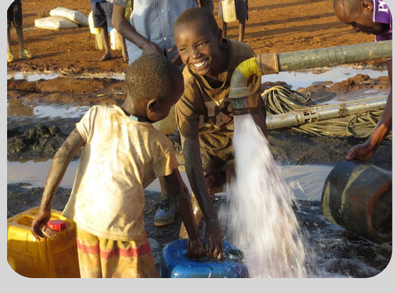
At the Esukuta Drilling

thing to worry about, especially during the current severe drought.